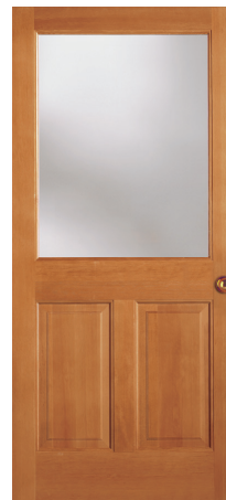
7044 WB INTERIOR

All doors with WaterBarrier come standard with UltraBlock® technology and Weather Seal™ process at stile-and-rail joints.