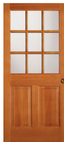
37944 WB INTERIOR