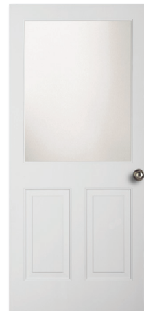
7044 WB EXTERIOR