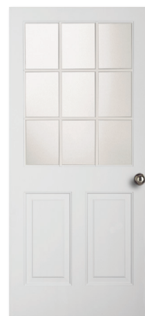
37944 WB EXTERIOR