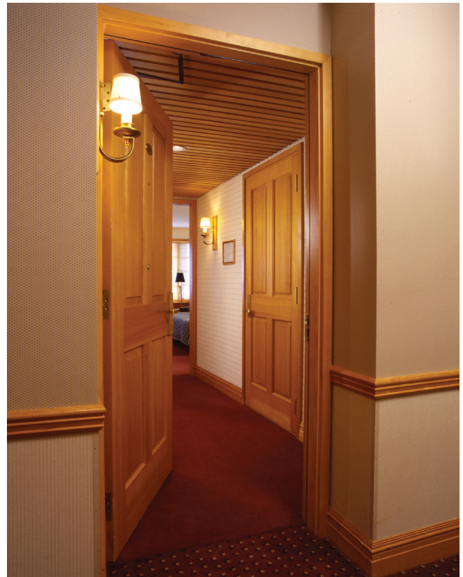
49220 Shown in walnut