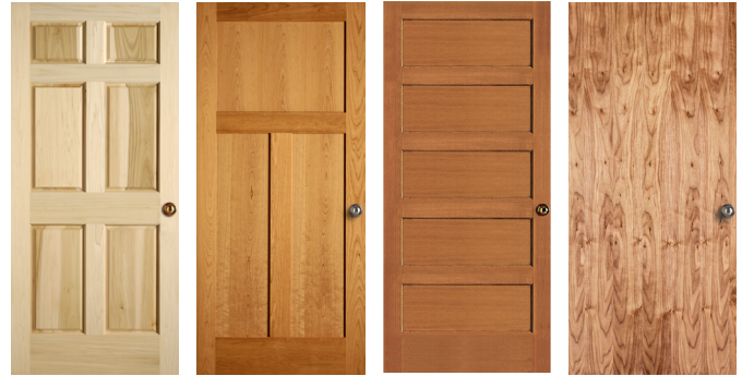
9266 RP Shown in poplar